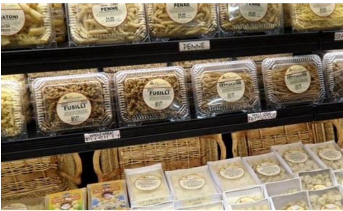
Can you make pasta from lasagne sheets. Can i use lasagna sheets as pasta.